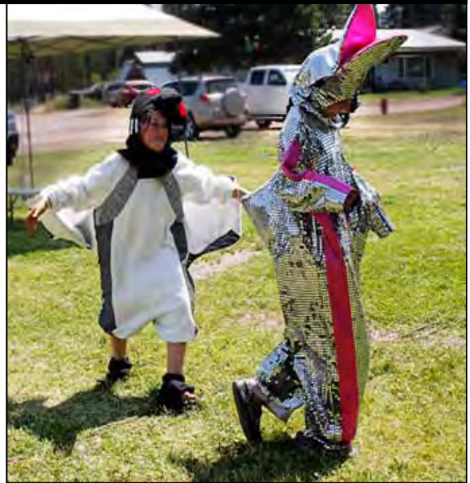
Our kid volunteers having a great time hamming it up.