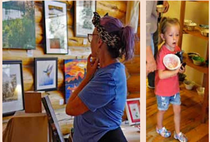
Lft: L&F Shopping and Rt. "I found just the right bowl Mommie!"