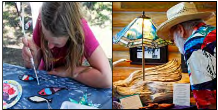
Kids art activities and the stained glass lamp donated by Georgina Staggs raised $900 for art scholarships.